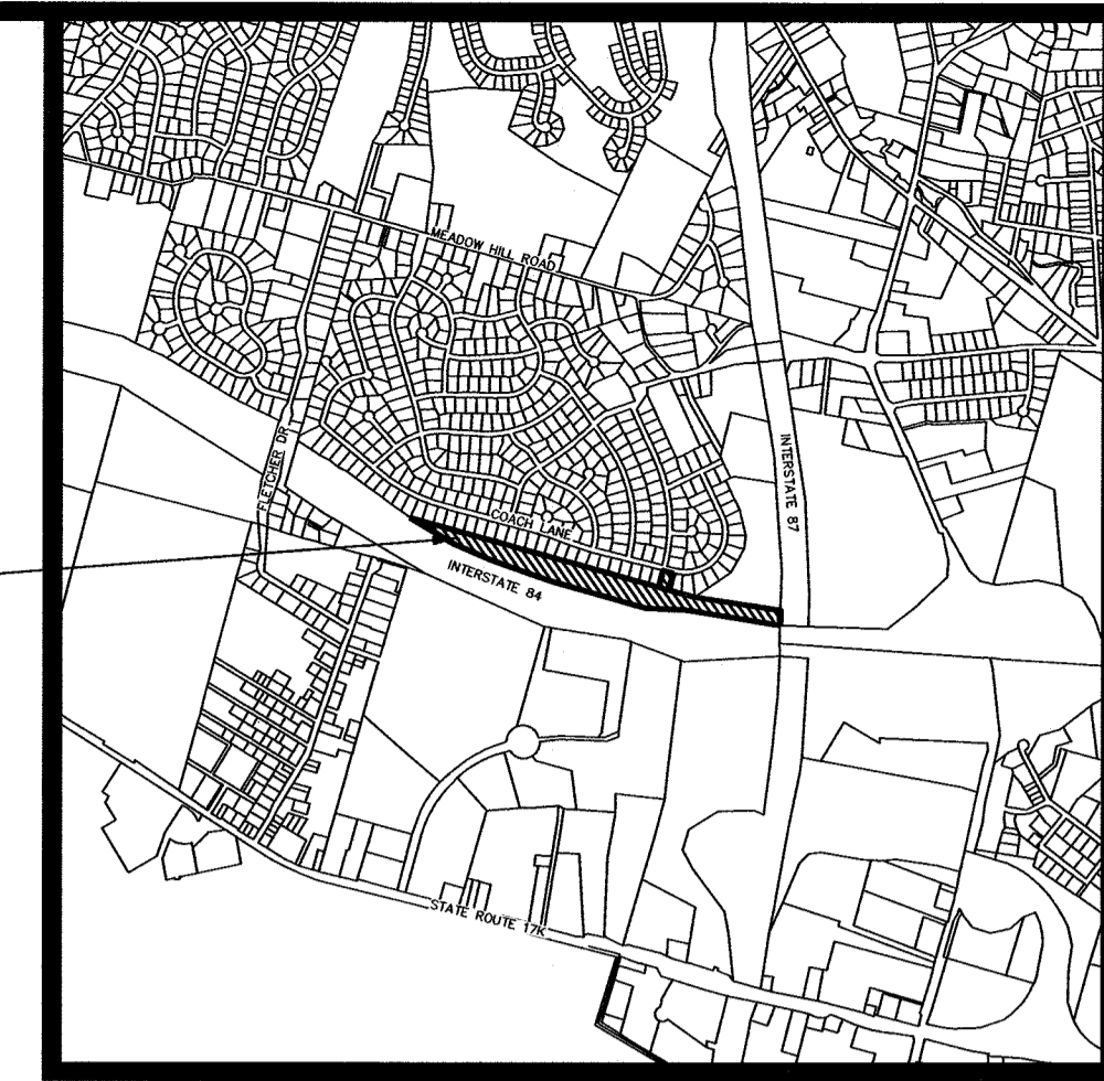
LOCATION PLAN 1 INCH = 2,000 FEET