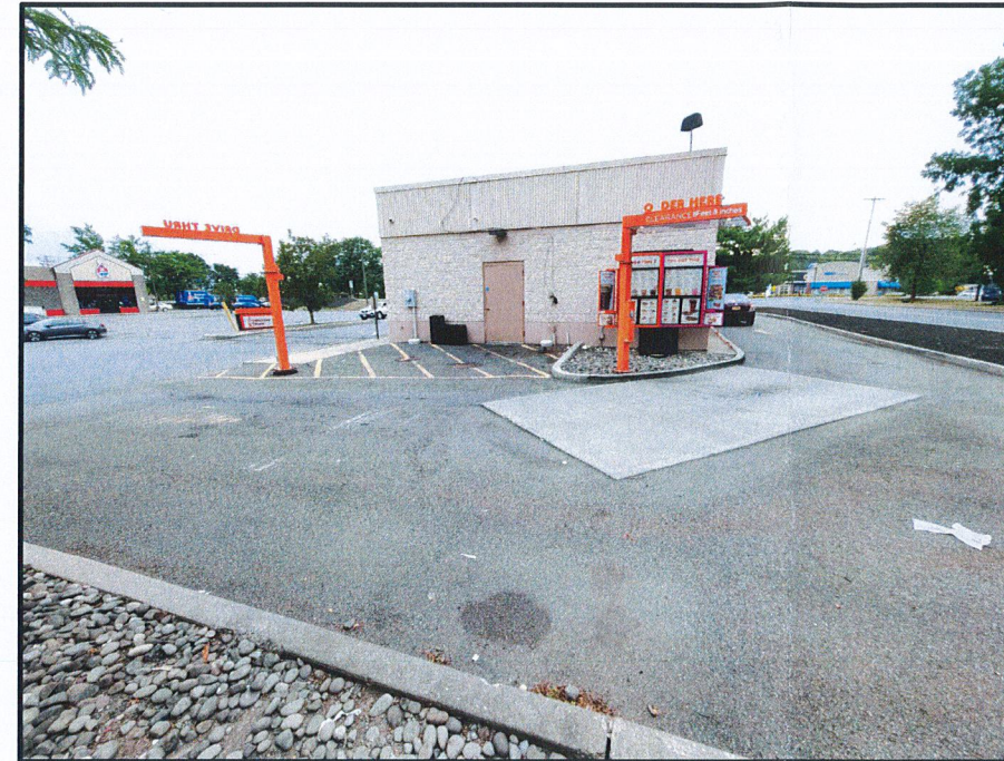
2 DIGITAL MENU BOARDS DETAIL