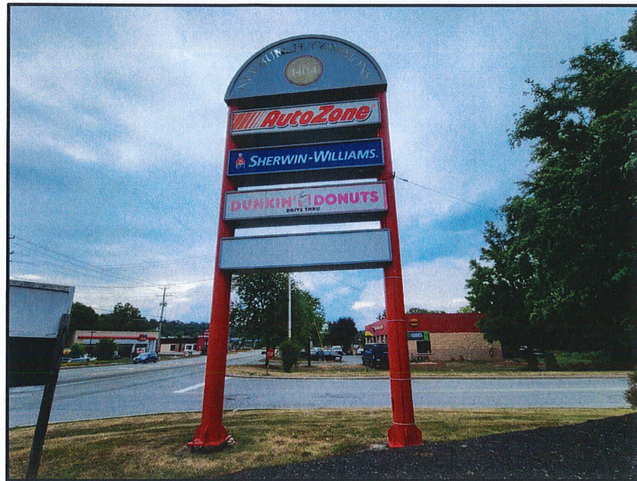
1 DIRECTIONAL SIGN DETAILS