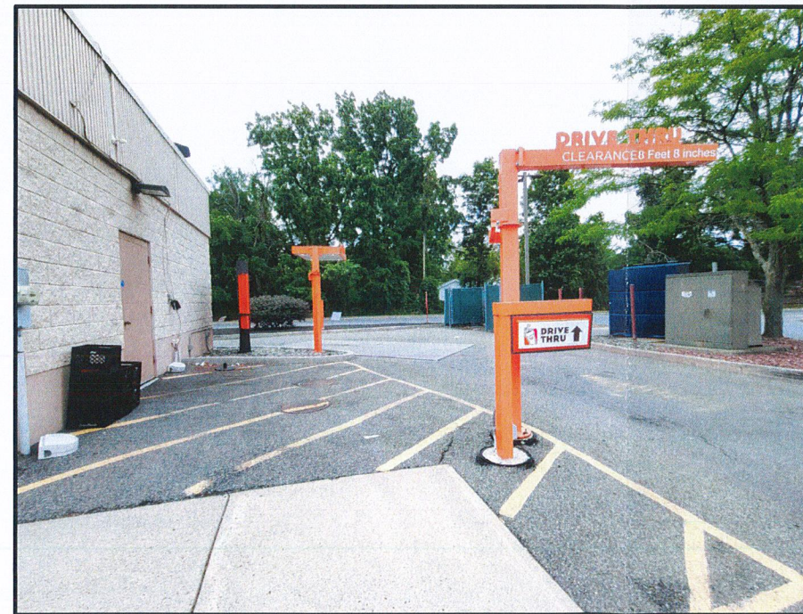
2 DIGITAL MENU BOARDS DETAIL