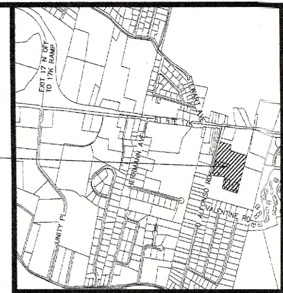
LOCATION PLAN 1 INCH = 1000 FEET